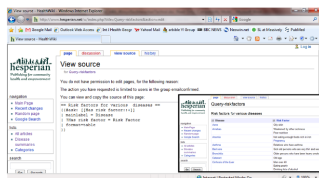
Figure 2. Source (syntax) of a semantic query about 'risk factors for various diseases' in the Hesperian Online Digital Library ( http://www.hesperian.net/w/index.php?title=Query-riskfactors&action=edit ). The results of this query can be seen on the corresponding 'page' tab ( http://www.hesperian.net/health/Query-riskfactors - Fig. 2 inset).

The Hesperian Online Digital Library ( http://www.hesperian.net/health/Main_Page - requires a username/password to access, which can be requested at http://www.hesperian.net/ - hesperian@hesperian.org ), a collaboration between the Hesperian Foundation (a non-profit US publisher of books and newsletters for community-based healthcare) and the University of California, Berkeley ( http://www.eecs.berkeley.edu/Research/Projects/Data/105520.html ), is another health-oriented semantic wiki example supporting 'semantic queries' ( http://www.hesperian.net/health/Main_Page#Structured_Queries--_Examples - Fig. 2). Ziesche [6] describes how semantic wikis can help in disaster relief operations.